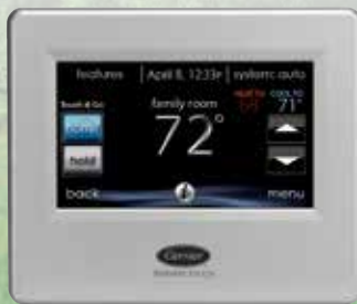
Infinity® Touch™ Control

* Full Infinity® System with the Infinity Touch™ Wall Control with Wi-Fi® capability. Remote access requires Wi-Fi model wall control and Apple™ or Android™ mobile device. Energy Tracking requires compatible equipment. Wi-Fi® is a registered trademark of Wi-Fi Alliance Corporation.