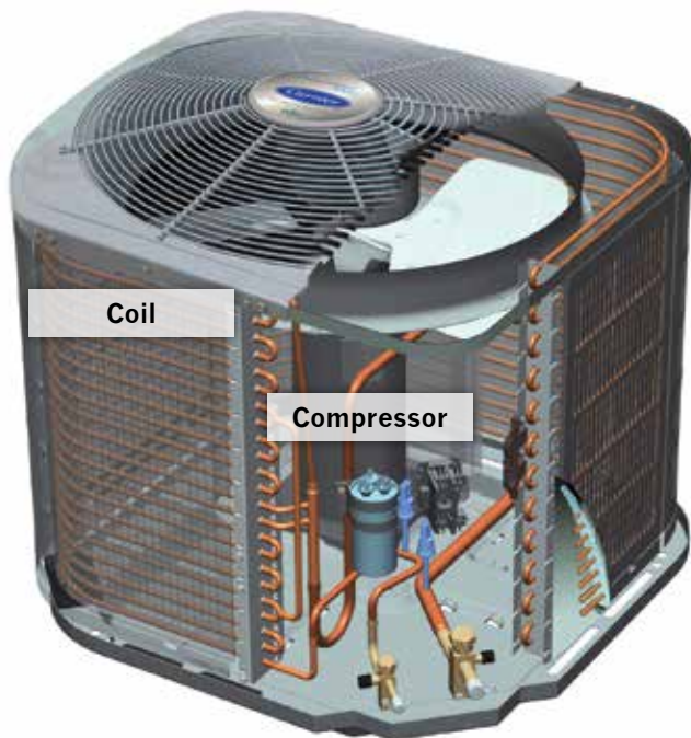
Performance™ 17 Air Conditioner Shown

Wi-Fi® is a registered trademark of the Wi-Fi Alliance Corporation.